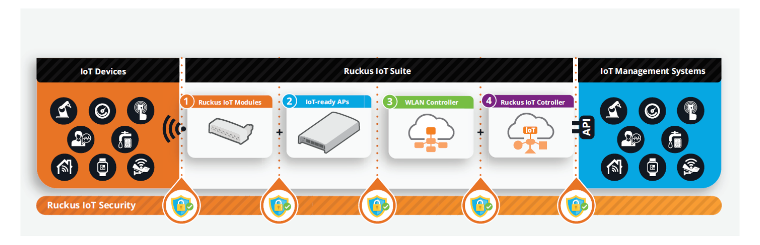
FIGURE 2 Ruckus IoT Overview

Ruckus has developed the Ruckus IoT Suite to enable a secure IoT access network. The following figure shows the various components that comprise the Ruckus IoT Suite. The following steps provide a brief introduction to each component, and prerequisites to be considered before installing the components on the network.